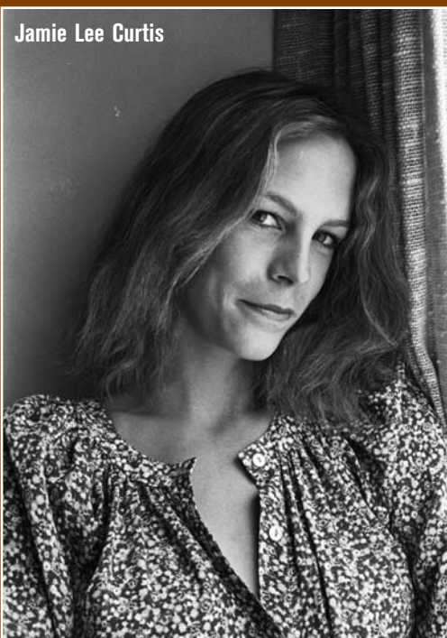
Jamie Lee Curtis

Her first 35mm SLR was a Pentax, which she used to shoot the Jimi Hendrix interview. After it was stolen she invested in a Nikon F2 Photomic: "That Nikon is considered an antique now, but I used it for all my film and television shoots. I still have my Nikon F2s, but today I also have a Canon EOS 20D digital SLR that I'm enjoying using very much although I still like to choose my own exposure and do the focusing myself."